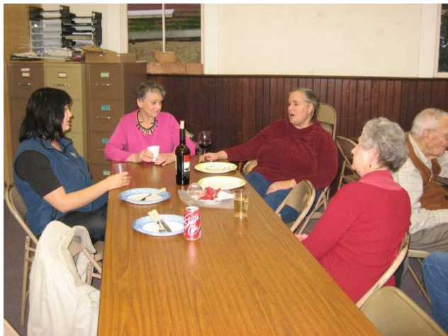
Think it will rain?