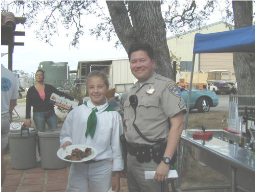
A couple of SLO County's Finest in Uniform