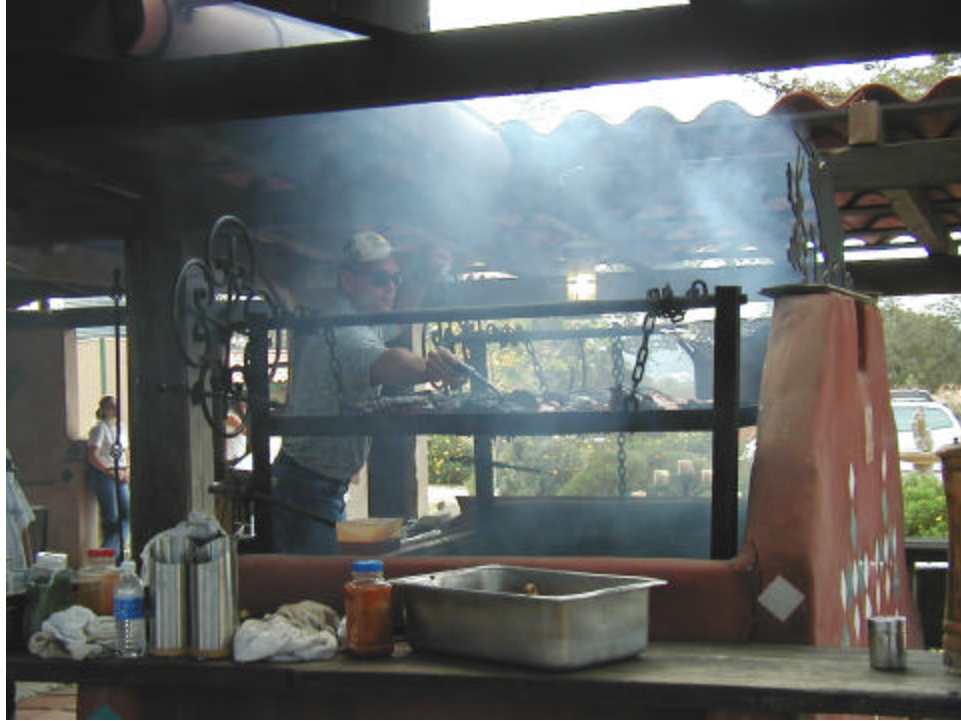
There was plenty of good eatin'!