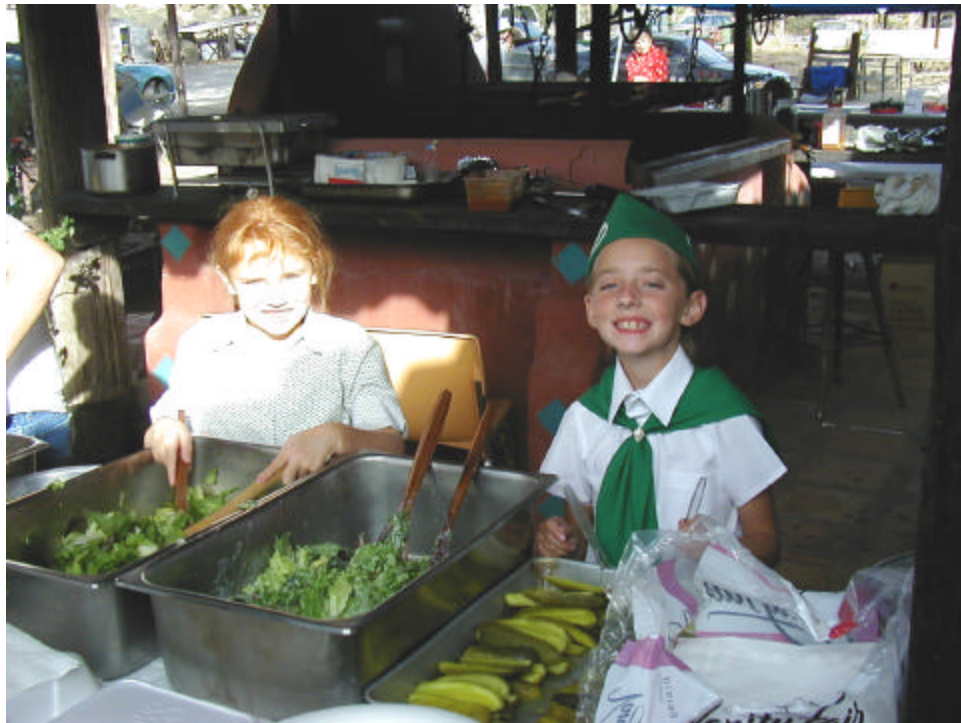
Service with a smile...